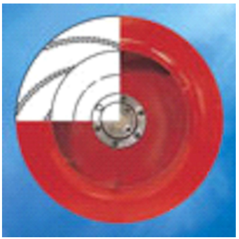
Clean Air Impeller - Type R

The clean air impeller is a closed bladed impeller with backward curved blades. This impeller is used for transport of clean air and of air with a small quantity of fine dust, such as welding smoke, oil mists or exhaust gases.