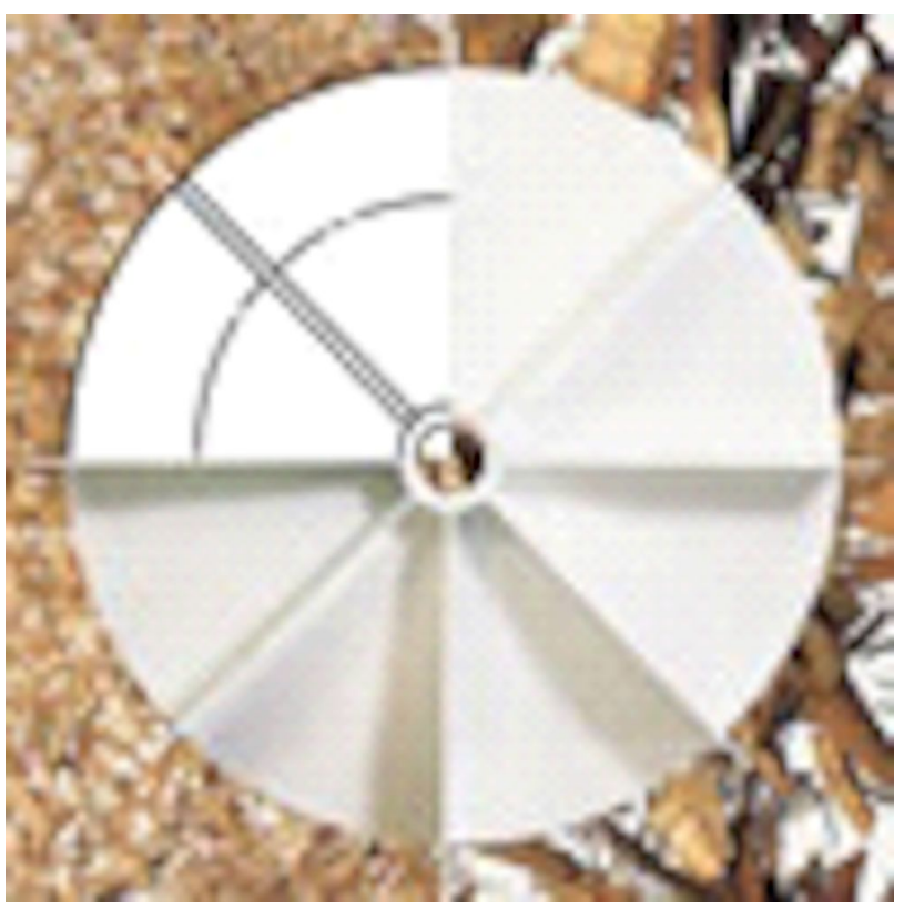
Transport Impeller - Type T The transport impeller is an open, self-cleaning bladed impeller with straight, radial blades. This impeller is used for transport of shavings, chips,

The transport impeller has an efficiency of up to 61%.